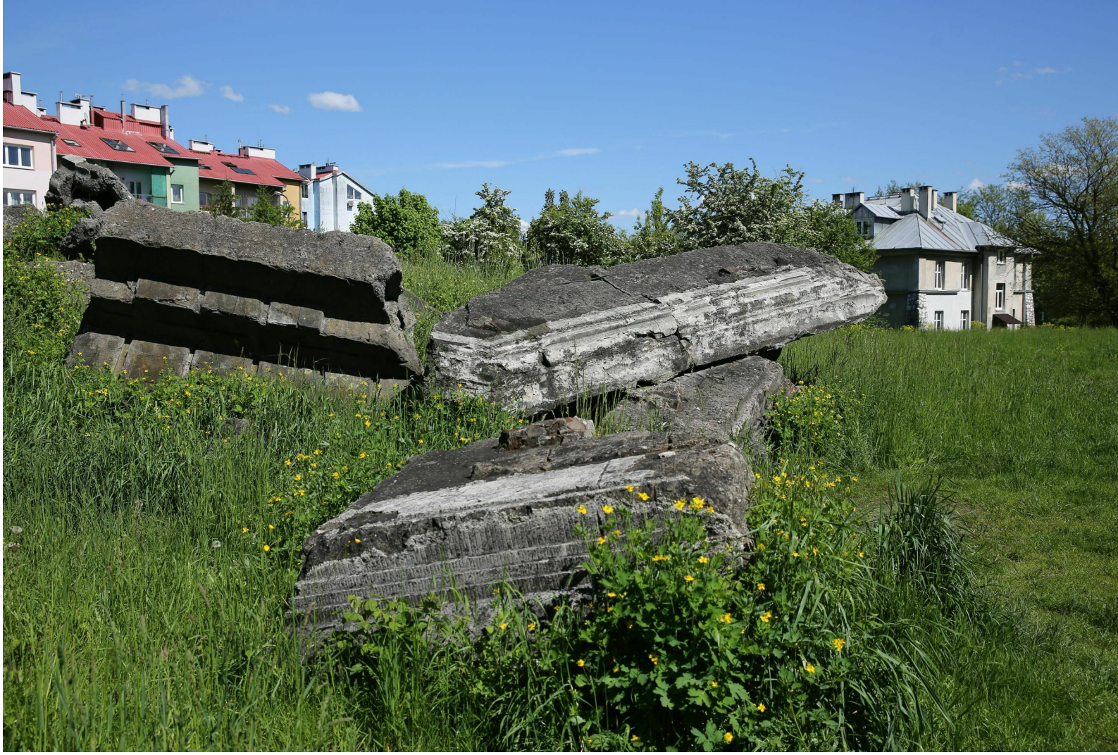
Relics of the preburial hall and the Grey House.

the space, its functioning in the consciousness of inhabitants of Cracow as a park area four kilometres from the main square. It is attractive, especially now, as our need to commemorate overlaps with the ecological need, an essential requirement. For this reason, the modified architectural design of the memorial envisages no interference in the almost 40 hectares of former camp grounds. When we think about the authenticity of this space, we observe two norms to which we want to refer. The first is respect for history, not creating any reconstructions, relying on what we have, supporting ourselves with the tools of advancement of civilisation, such as noninvasive archaeological research. The second is that it will all remain green, without a fence, and provided the rules and regulations are observed, we will not restrict access to those who wish to reflect and walk around with a sense of respect for the space. We try to reconcile these two factors while being aware that any regulation may be demanding. The area has been without a caretaker for many years, so there seem to be fewer standards there today, than in any public square within Cracow. We are talking about people who walk their dogs there, spend time