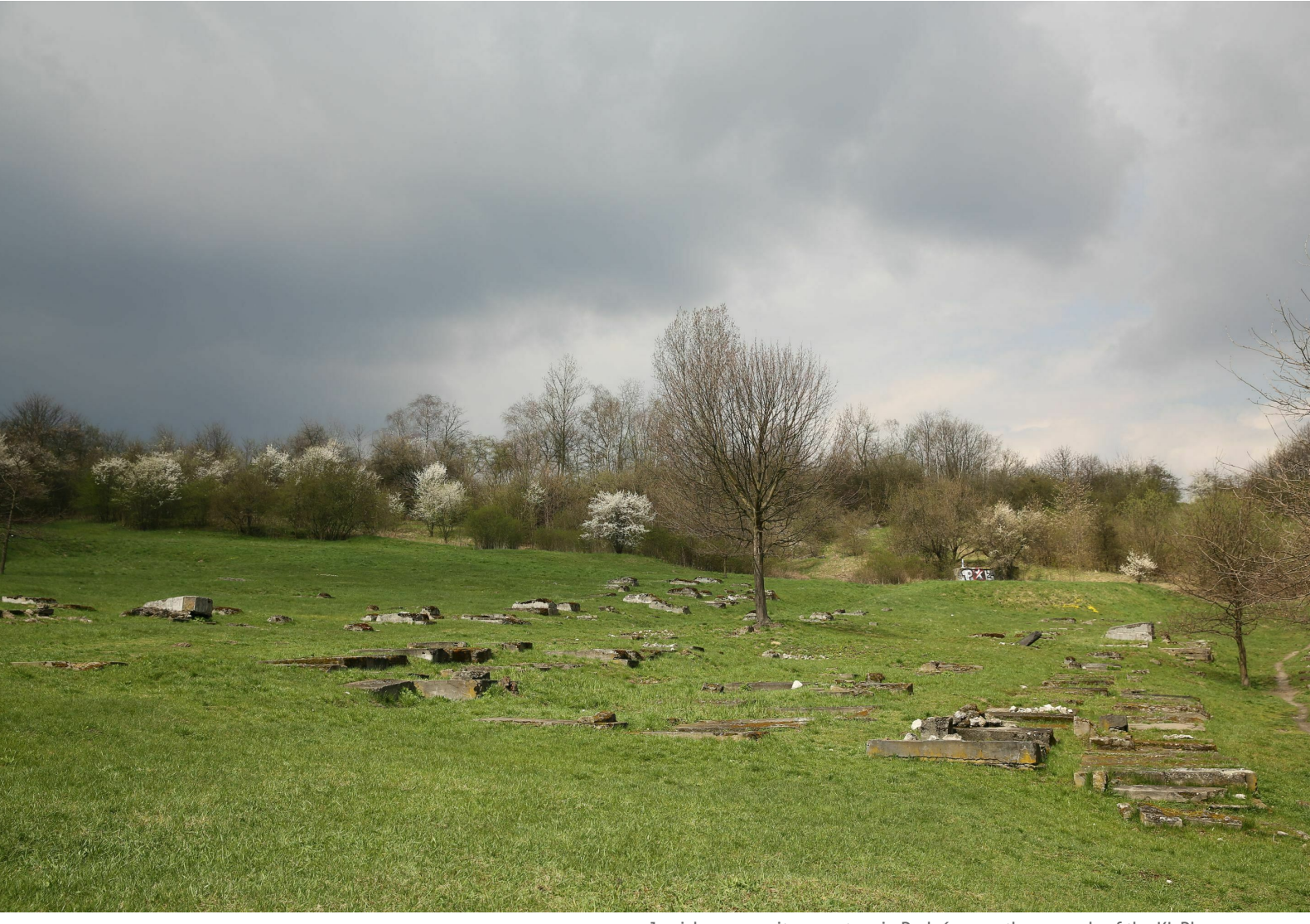
Jewish community cemetery in Podgórze on the grounds of the KL Plaszow memorial site.

of the KL Plaszow Memorial Museum Workshop at the Cracow Museum – it was a unit responsible for research and commemoration activities. We visited archives, collected scattered resources related to the history of this site, which served as the basis for a Digital Archive of KL Plaszow, and carried out invasive and non-invasive archaeological research of the area, during which we acquired artefacts related to the history of the camp. A commemoration scenario has also been created. Everything that transpired within the structures of a single museum was linked with the intention of our current organisers, the Municipality of Krakow and the Ministry of Culture, National Heritage and Sport, to bring about the appointment of a guardian for the site. The first step was the intention, expressed in the 2017 agreement, that the owners of the land on which the memorial is situated, the Municipality of Cracow and the Jewish Community, would consent to the establishment of a museum there in the future. It was followed by further formal steps, resulting in the establishment of the KL Plaszow Museum in early 2021.