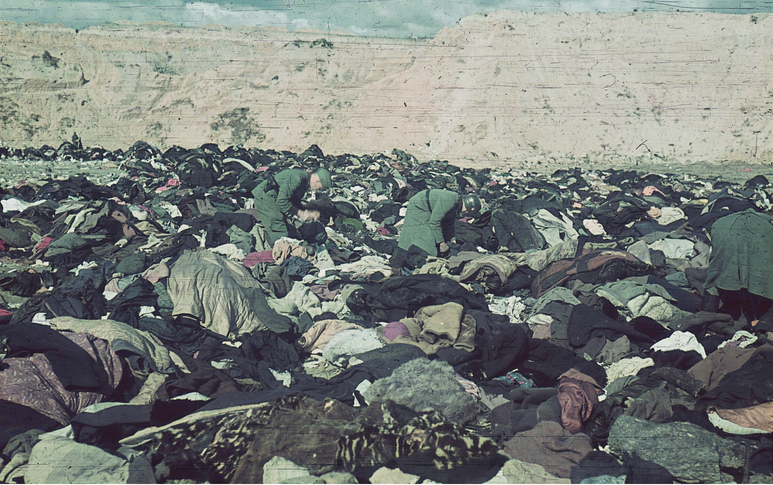
German soldiers rummage through the belongings of Jews shot in the Babin Yar tract

the challenge of memory is more acute today than ever before.