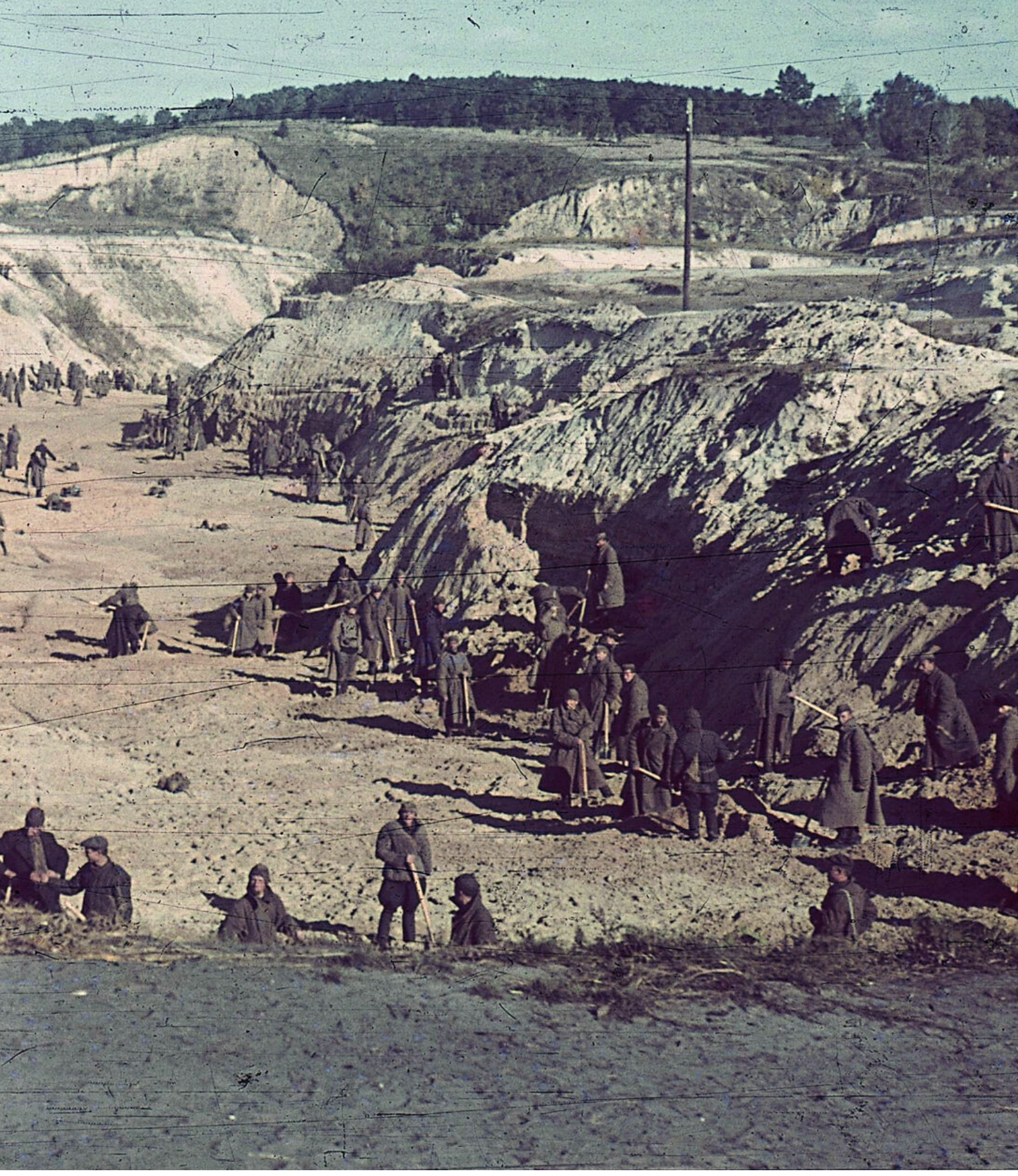
Soviet prisoners of war under the protection of German soldiers bury the bodies of Jews shot on September 29-30, 1941 in Babyn Yar.

Additional powerful memorials will be unveiled later this year to mark the massacre's 80th anniversary. Visitors will have no doubt about the exact death that took place there. "Never Again" demands bringing tragedies such as Babyn Yar to greater academic and