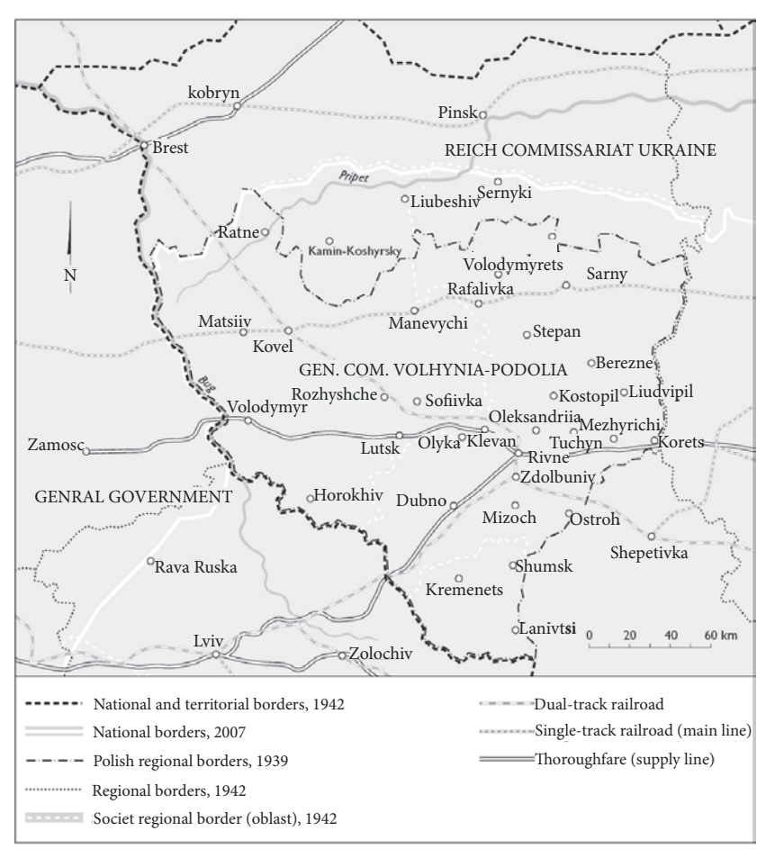
MAP 1 Western Volhynia