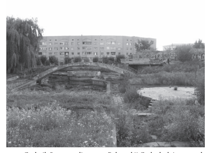
FIGURE 3.4 Grabnik Square, adjacent to Pokrovskii Cathedral, is now a decrepit and rundown urban blight.