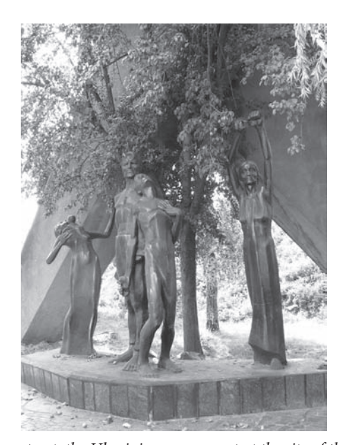
FIGURE 3.6 In contrast, the Ukrainian monument at the site of the Gestapo Prison and mass grave on Belaia Street is well maintained. The granite cross that marks the site remembers the "52,000 men and women" who died there, failing to mention that many were Jews.