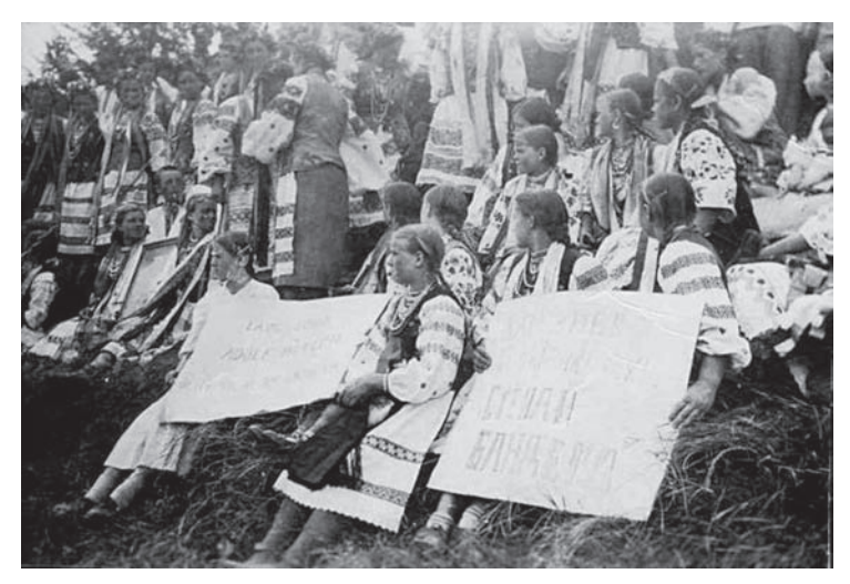
FIGURE 2.11 (Left) "Long Live Adolph Hitler!" (Right) "Long Live Stepan Bandera!"