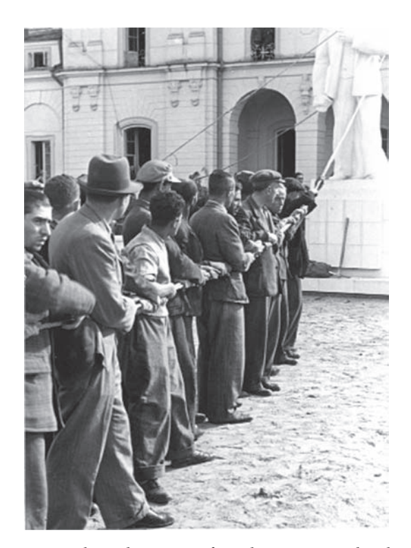
FIGURE 1.3 Iconoclastic destruction of a Stalin statue in Białystok, Poland, July 1941

In the first months of the war, Soviet Jews caught behind German lines were forced to take part in humiliating rites of iconoclastic violence—"Lenin funerals" and "Stalin parades"—where non-Jewish neighbors were encouraged to taunt Jewish men, women, and children as they dismantled symbols of communist authority, sang communist or Jewish songs, chanted communist or Jewish prayers. In dozens of documented cases, such rituals normally ended in violence—as the communist symbols, usually statues of Lenin or Stalin, were buried alongside local Jews who were massacred by their non-Jewish neighbors. After the end of such "self-cleansing" pogroms in summer 1941, German propagandists and their local collaborators continued to report on actions against Jews in local media outlets, and regularly informed the local public about the progress in the war against the "Jewish-Communist" element.