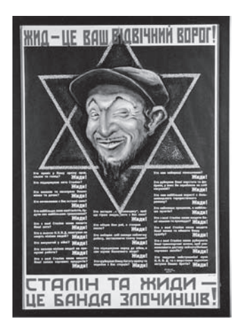
FIGURE 2.7 "The yid is your eternal enemy!...• Who brought you famine, tears and mass murder? THE YID! /• Who devised the worst NKVD torture methods and sadistically tortured your brothers? THE YID! /• Who worked least and ate best? THE YID! /• Who abducts your wives and daughters and then defiles them? THE YID! /• Who has exterminated millions of people in the cellars of the NKVD? THE YID! /• Who has the nicest apartments? THE YID! /• Who denounced capitalists the most but had an insatiable lust for money himself? THE YID! / STALIN AND THE YIDS -ONE VILLAINOUS GANG!"