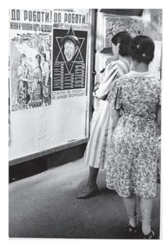
FIGURE 2.8 Ubiquitous culture of hate in German-occupied Ukraine. Ukrainian women view anti-Jewish hate posters, no date. In Ukrainian, the poster reads in part: "STALIN AND THE YIDS -ONE VILLAINOUS GANG!"