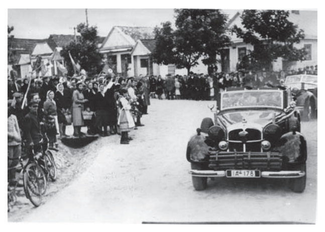
FIGURE 3.2 Reichsminister Alfred Rosenberg enters Rovno on June 22, 1942 to celebrate the one-year anniversary of the war with the Soviets.