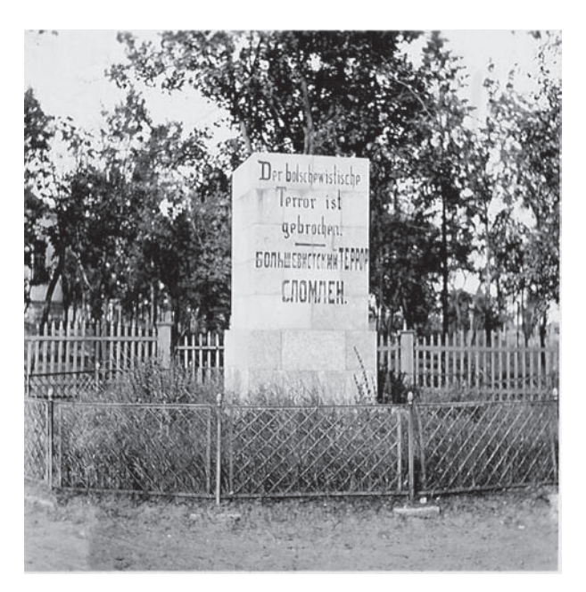
FIGURE 1.2 On the base of a destroyed Stalin statue in eastern Ukraine, written in German and Russian, "The Bolshevik Terror Has Been Broken."