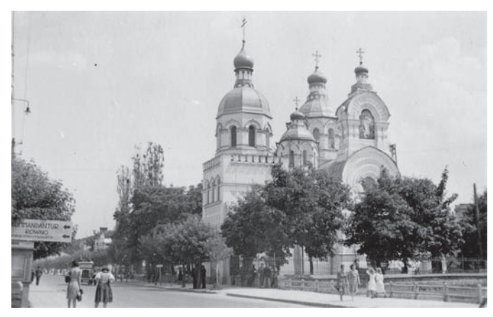
FIGURE 2.12 Pokrovskii Cathedral in Rovno: the Orthodox cathedral at Grabnik Square where the Jews were assembled on November 7, 1941. 17,500 Rovno Jewish adults and more than 6,000 of their children were forced to leave their bags in large piles on the square, then to walk to the killing site at Sosenki Forest, some four kilometers east of the city center.