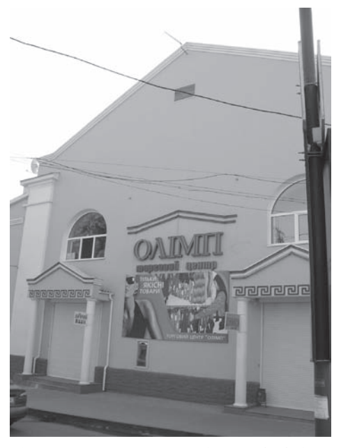
FIGURE 3.3 Rovno's Great Synagogue is now the site of a fashionable fitness and shopping center.