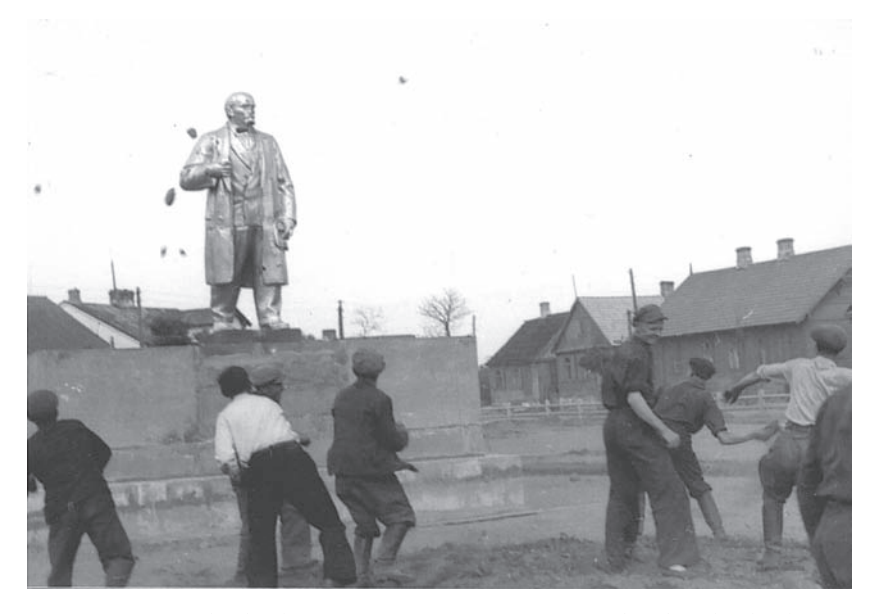
FIGURE 1.4 Local Poles throw stones at a Lenin statue in Białystok, Poland, July 1941

Second, the Holocaust in the East was by and large carried out openly, in the presence of non-Jewish locals. In the West, most Jewish victims of the Holocaust were rounded up and forcibly transported in sealed trains to concentration camps in Central and Eastern Europe. This distance generated considerable space for deniability: that Jews had been the victims of deportation and forced labor, not of mass annihilation. In contrast, a much smaller proportion of Soviet and East European Jews were exterminated in camps. While most Western and Central European Jews perished in the "industrial efficiency" of the camps, most Jews in the Soviet and Eastern European zones were shot, and the overwhelming majority were massacred at designated killing sites in or near their own homes by predominantly local ethnic nationalist militias who played the central roles in their executions.<sup>15</sup>