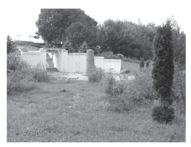
FIGURE 3.5 The Jewish Memorial at Sosenki constructed by Israeli and international Jewish donations in 1991 has now fallen into neglect and disrepair, overgrown with weeds, and the frequent target of anti-Semitic arson and grave robberies.