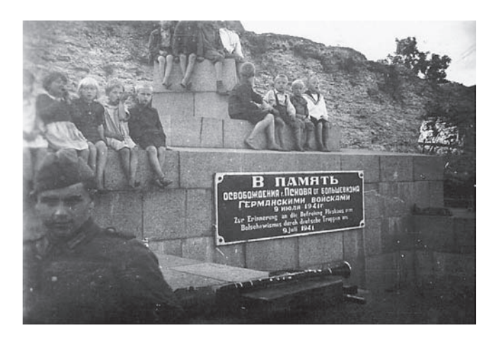
FIGURE 1.1 The Wehrmacht as an army of liberation from the Jewish-Communist threat. On the base of a destroyed Lenin statue in northwest Russia, the German occupying authority constructed a new monument with this plaque (in Russian and German): "In Commemoration of the Liberation of Pskov by the Germany Army, July 9, 1941"