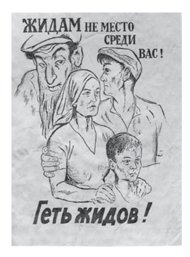
FIGURE 2.6 "There is no place for yids among you! Out with the yids!"