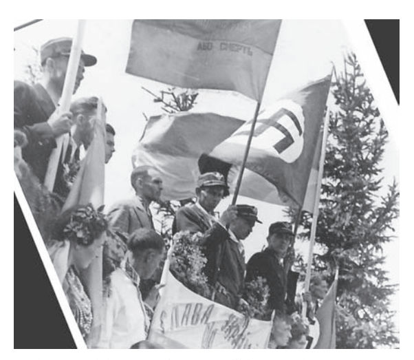
FIGURE 2.10 July 1941 celebration of German "liberation" in Rovno. Printed on the blue and yellow Ukrainian flag are the words: "Volia Ukraini abo smert'"—"Freedom for Ukraine, or death." On the banner is the symbol of the Ukrainian liberation movement, the trident (tryzub), and the nationalist oath: "Slava Ukraine," "God Bless Ukraine!"

The German treatment of the Jews began to get worse and worse by the day. One day after working in the army barracks "Reichskommissar" Koch came upon an idea, that all men and women should undress completely and have each group pour water over the other group from large buckets, with water that was left over from washing the toilets, hallways and steps. Under the order of this armed maniac we were forced to perform this hellish act if we wanted to escape death. When an army unit was walking down the street and they came across a Jew on the road, they shot him on the spot because they believed Jews were bad omens. On another occasion, upon seeing a group of Jews standing in line, a motorcycle driver drove onto the side walk with his motorcycle, critically injuring one Jew, who eventually died.<sup>30</sup>