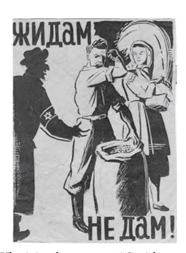
FIGURE 2.5 German Ukrainian-language anti-Jewish poster: "We will give nothing to yids!"

Immediately upon arrival, the German occupation authority made every effort to drive a wedge between local civilians and Jews. The standard orders posted in newly conquered zones read: "Should anyone give asylum to a Jew or let him stay overnight he, as well as the members of his household, will be shot by a firing squad immediately." Besides these notices, anti-Jewish placards were posted everywhere: "We will give nothing to yids!" "There is no place for yids among you! Out with the yids!" "The yid is your eternal enemy!"